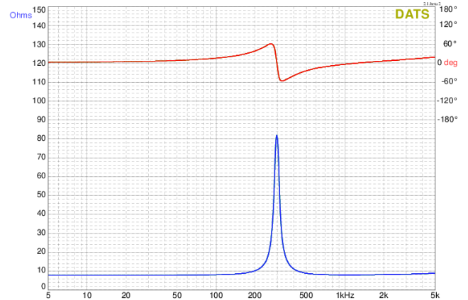
Measurement taken with transducer uncoupled facing upward.